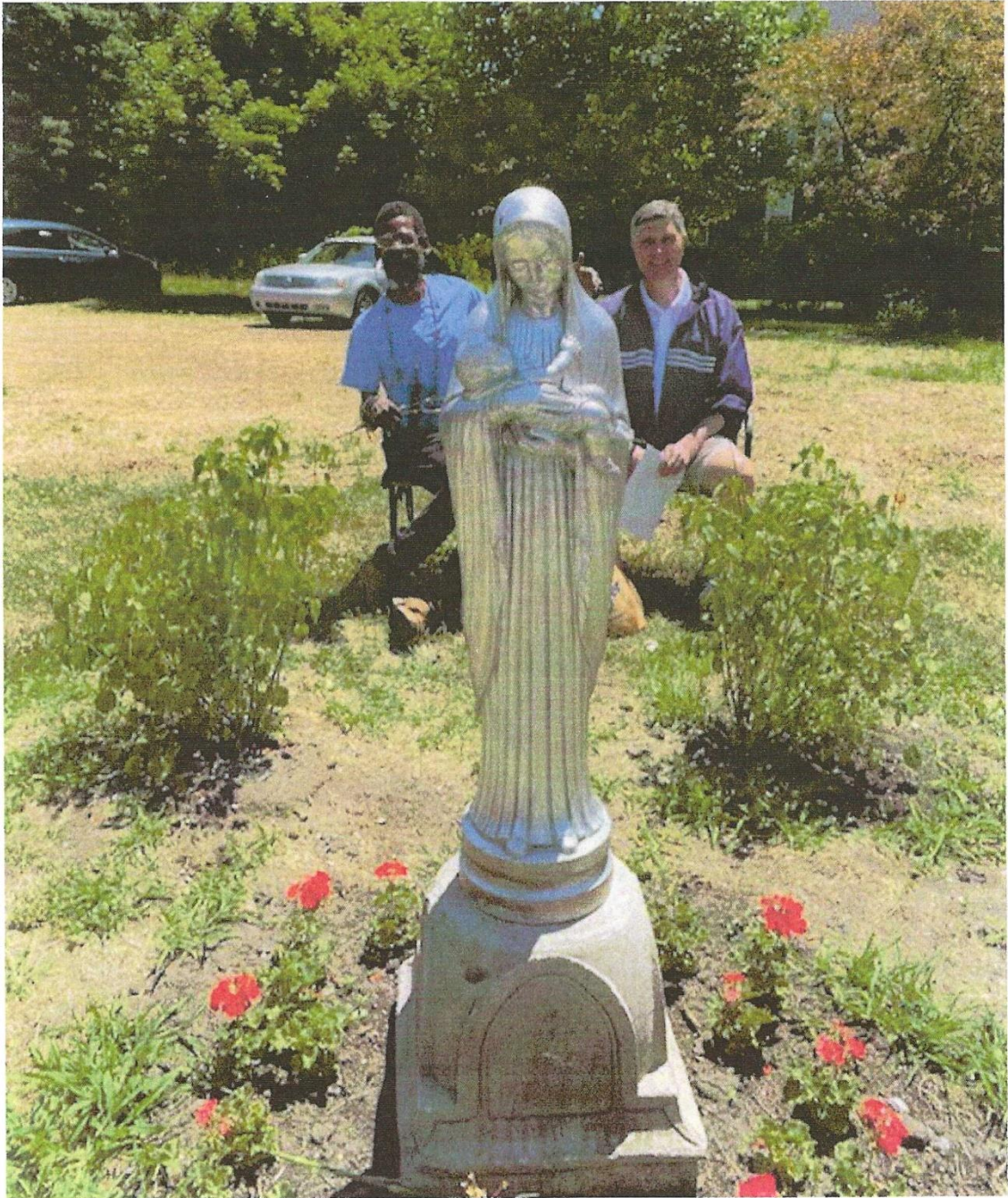
St. Charles Members Enjoying Our New Bench and Statue in The St. Paul/Baldwin Lot